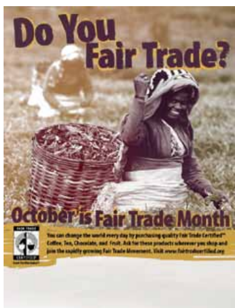
Fair Trade Poster • 18" x 24"

Fair Trade means quality gourmet products. It is also a market-based solution to the profound coffee crisis, a new trade alternative and a window into the lives of producers from 60 countries spanning the globe.