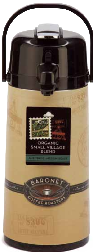
Airpot with Wrap and Fair Trade Flavor Tag

We carry a wide variety of single origin, Fair Trade coffees. Contact us for a complete list of our offerings!