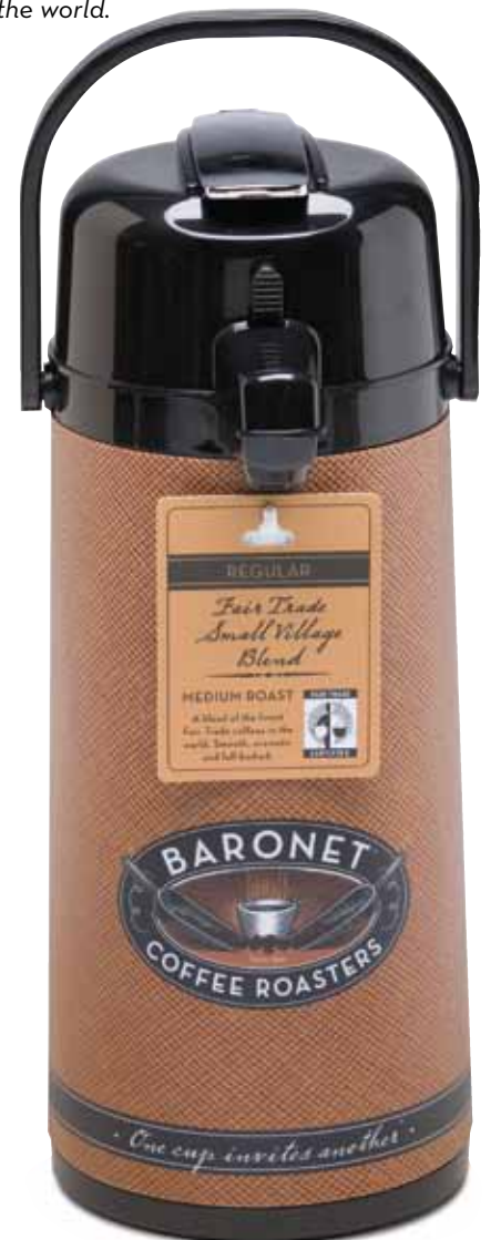
Airpot with Wrap and Fair Trade Flavor Tag

We carry a wide variety of single origin, Fair Trade coffees. Contact us for a complete list of our offerings!