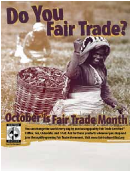
Fair Trade Poster • 18" x 24"

Fair Trade means quality gourmet products. It is also a market-based solution to the profound coffee crisis, a new trade alternative and a window into the lives of producers from 60 countries spanning the globe. Baronet® Coffee offers the following Fair Trade varieties to please those of your customers who base their purchasing decisions on how the products they consume affect the world.